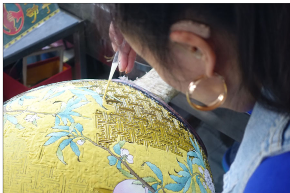
Fig. 9 Beijing Enamel Factory Co. Ltd.

The factory receives many orders annually from private customers, government agencies and corporate institutions. They also produce pieces for exhibitions, both nationally and internationally, and have won awards for their work. However, most of their income is generated from the smaller products sold to the public and