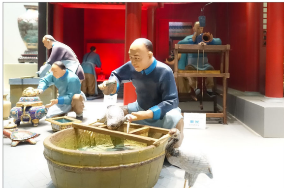
Fig. 10 The Cloisonné Art Museum of China, Beijing Enamel Factory Co. Ltd.

The north of England played a major role in the Industrial Revolution (Ashworth 2017), particularly in the cotton industry, the legacy of which can still be seen in the industrial architecture of many towns and cities in this region. Quarry Bank Mill in Cheshire is one of the best-preserved textile mills from this era and is a Grade II listed building (National Trust 2019a) (Fig. 11 Looms, Quarry Bank Mill, Manchester). The mill and estate were given to the National Trust in 1939 even though it continued its production until 1959. Once production ceased, the National Trust also acquired Quarry Bank House and the surrounding gardens. Today, parts of the mill are still operational and visitors can see the looms and