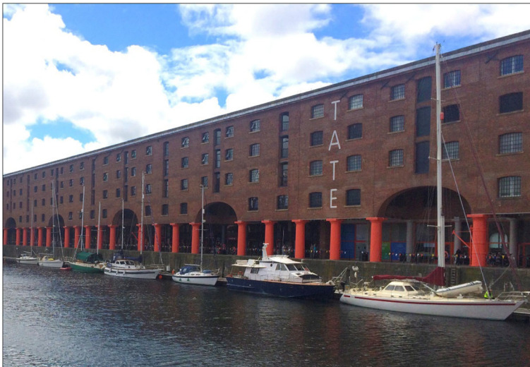
Fig. 12 Albert Dock Regeneration, Liverpool

Liverpool is also a significant city due to it being the childhood home of the world-famous pop group The Beatles, who became internationally renowned in the 1960s and 1970s. The Cavern Club, located in the centre of the city, is one of the