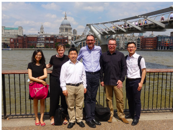
Fig. 17 Design Ecologies Research Team, London July 2018

From the visits to the UK and China, the research team identified themes that emerged from the interviews and observations made, the most pertinent of which are detailed below (Fig. 17 Design Ecologies Research Team, London July 2018).