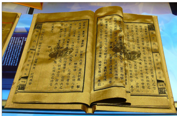
Fig. 3 Silk Book, The Shanghai Silk Group Company

M50 is now a cultural zone that was once the site of various factory buildings. The area developed as artists moved into the district, attracted by the cheap rents available in this old industrial area. Today, M50 is home to over 100 artists' studios, galleries, design agencies and other cultural enterprises, and is a major tourist attraction in the city (Fig. 4 Bamboo Weaving over Porcelain, M50 Creative Park, Shanghai).