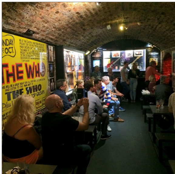
Fig. 13 Cavern Club, Liverpool

The June 2017 visit took place at Lancaster University and the Lake District, Cumbria. The focus of this visit was cultural heritage, especially that of the British Romantic Period, which in many ways was a reaction to the industrialisation occurring just to the south in Manchester, Liverpool, and environs, during the nineteenth century. The centre of the British Romantic movement was the English Lake