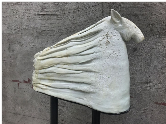
Fig. 7 Zhu Legeng Ceramics Studio, Jingdezhen

This redevelopment came about in part through President Xi Jinping's desire to reduce air pollution in Beijing. The steelworks has been relocated on the coast. This change of use from industrial to cultural is on a vast scale, with a large number of the old factory buildings being used for new purposes;