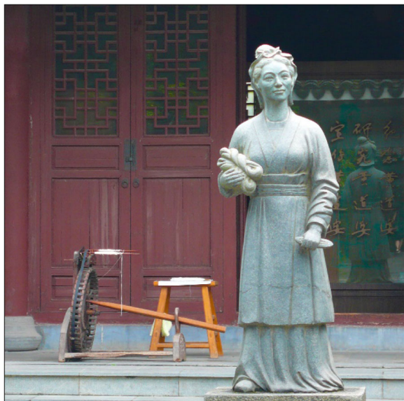
Fig. 1 Huang Daopo Memorial and Museum

A visit to the Tianzifang Area offered insights into the development of a cultural area that now houses fashionable bars, restaurants and shops. This was originally a residential area that was saved from high-rise development and repurposed to attract young residents and tourists (Fig. 2 Tianzifang, Shanghai). When first redeveloped, it was home to many small crafts and arts enterprises. Today, however, due to its success in attracting tourists, rents have increased. There are now many more shops, bars and food outlets, while many of the small crafts and arts enterprises have moved out.