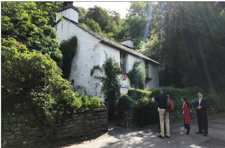
Fig. 14 Wordsworth’s home, Dove Cottage, English Lake District

The museum, cottage, tea rooms and shop are run by the Wordsworth Trust (Wordsworth Trust 2019). The cottage is a small house, with very small rooms which are furnished with original pieces. The lives of Wordsworth and his wife Mary are told of within the house and the Wordsworth museum, which at the time of our visit was undergoing significant expansion in order to develop the exhibition space and enlarge the café and gift shop. In the village of Grasmere, now a popular site for tourists with many cafés, restaurants and gift shops, lies a small church with a churchyard containing Wordsworth’s grave. For the Chinese team, the