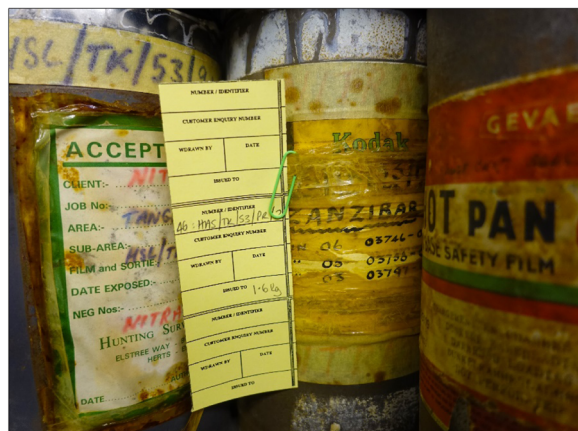
Fig. 16 Historic England Archive, Swindon

The headquarters of Historic England in Swindon are home to the Historic England Archive and Library, which holds over 60,000 books, journals and reports relating to the historic environment of England and over 12 million photographs, drawings, reports and publications ranging from architectural details and plans to archaeological sites throughout the country (Fig. 16 Historic England Archive, Swindon). A major project is being undertaken to digitise much of the collection in