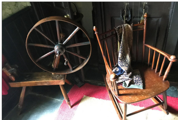
Fig. 15 Traditional Spinning Wheel and Rocking Chair, Hill Top Farmhouse, English Lake District