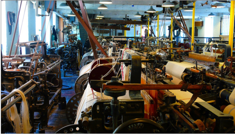
Fig. 11 Looms, Quarry Bank Mill, Manchester

other machinery in action, in a manner similar to the ‘living museum’ visited in China. However, unlike the examples in China, Quarry Bank does not produce goods as the looms are only operated for demonstration purposes. The mill museum also has an immersive audio-visual experience, where visitors are able to see the types of work formerly carried out in the mill and to learn about the social history of the site and those who worked there.