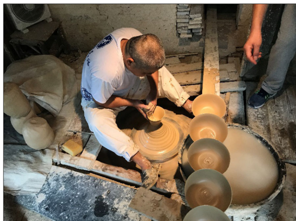
Fig. 6 Jingdezhen Heritage of Ceramics Industry Museum

The Jingdezhen Heritage of Ceramics Industry Museum – The Imperial Kiln Site of Jingdezhen is designated by UNESCO and comprises a 'living museum' experience where experienced craftspeople in traditional dress demonstrate all aspects of the production of porcelain using heritage techniques (Fig. 6 Jingdezhen Heritage of Ceramics Industry Museum). These practices are faithfully adhered to and a high degree of skill is in evidence in the largely aging workforce. The process employs a division of labour where individual tasks are conducted by specialists. Collectively, these result in the