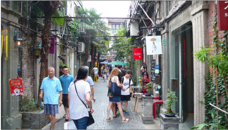
Fig. 2 Tianzifang, Shanghai

The Shanghai Silk Group Company produces double-sided silk embroidery, which is a highly skilled and very time-consuming practice. The company also produces fine, high-quality silk weaving of traditional pictures and it weaves the lettering in silk books using sophisticated digital weaving techniques. Such items are very expensive and are given as gifts to royalty and visiting dignitaries (Fig. 3 Silk Book, The Shanghai Silk Group Company). This visit demonstrated how traditional craft is being sustained in China not only by continuing traditional methods but also by embracing new technologies. In addition, this company was also making medical products from 3D woven silk.