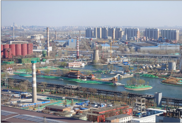
Fig. 8 Shougang Park Regeneration Site, Beijing

this again demonstrates the importance of the cultural heritage sector in China. Similar examples of industrial site repurposing in the UK are not on the same scale as Shougang. Often, such large sites would be partially or wholly demolished, perhaps with key buildings being retained and showcased, but at Shougang a great many buildings and much of the industrial infrastructure have been retained. Examples in the UK of such transformative use include old mills and power stations that have been re-purposed into cultural institutions, such as the Baltic Flour Mill in the Northeast (Baltic 2019) and Tate Modern in London (Tate Gallery 2019), both of which are now internationally renowned art galleries. In the former South Wales steel town of Ebbw Vale, however, the steelworks, which was on a similar scale as Shougang, was entirely removed and the valley floor was rebuilt with new facilities such as a hospital, leisure centre and educational facilities.